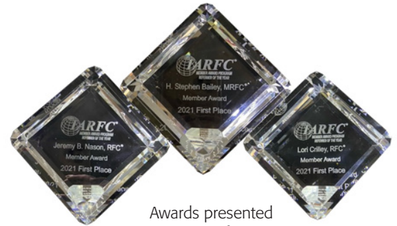
Awards presented to top 3 referrers.